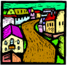
Road from Town